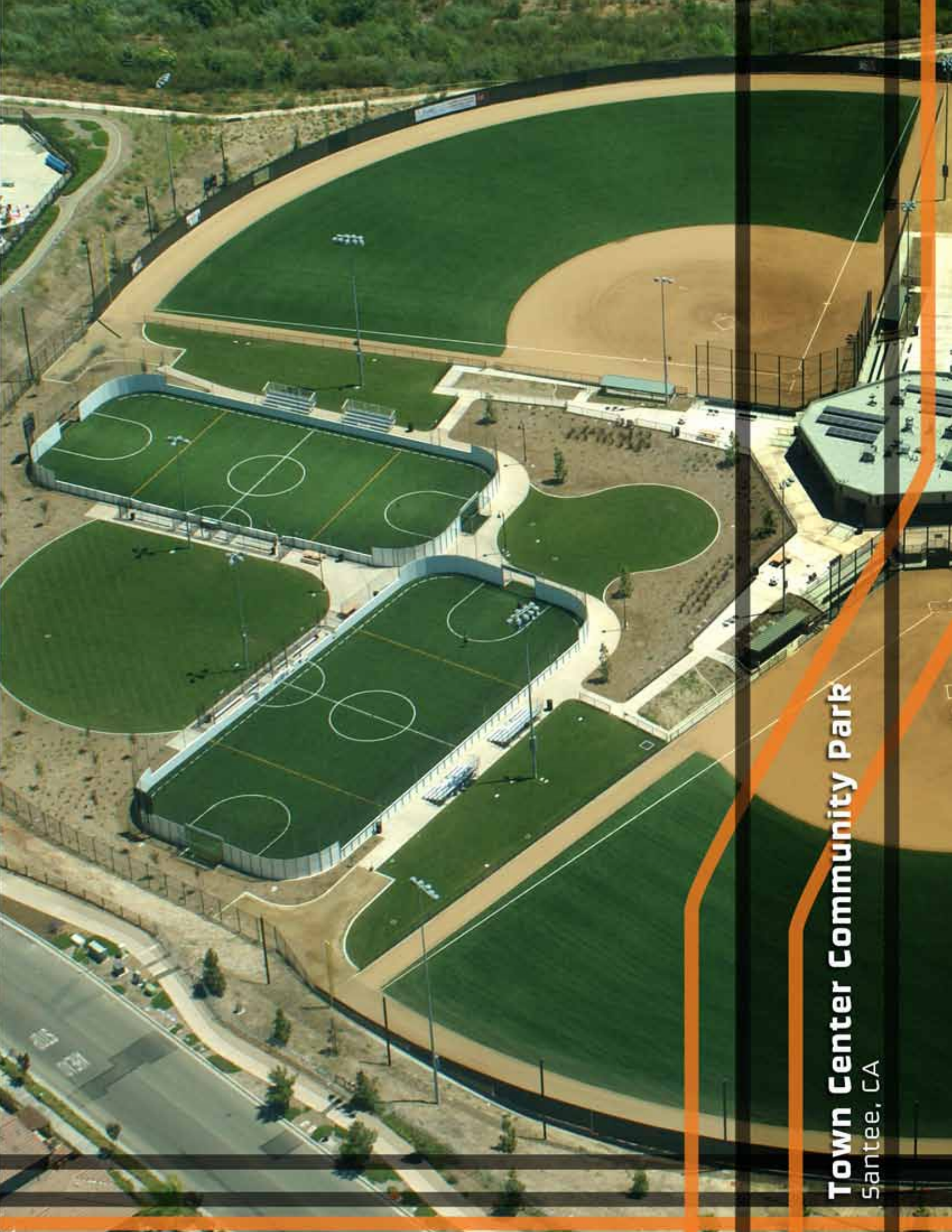
Town Center Community Park Santee, CA